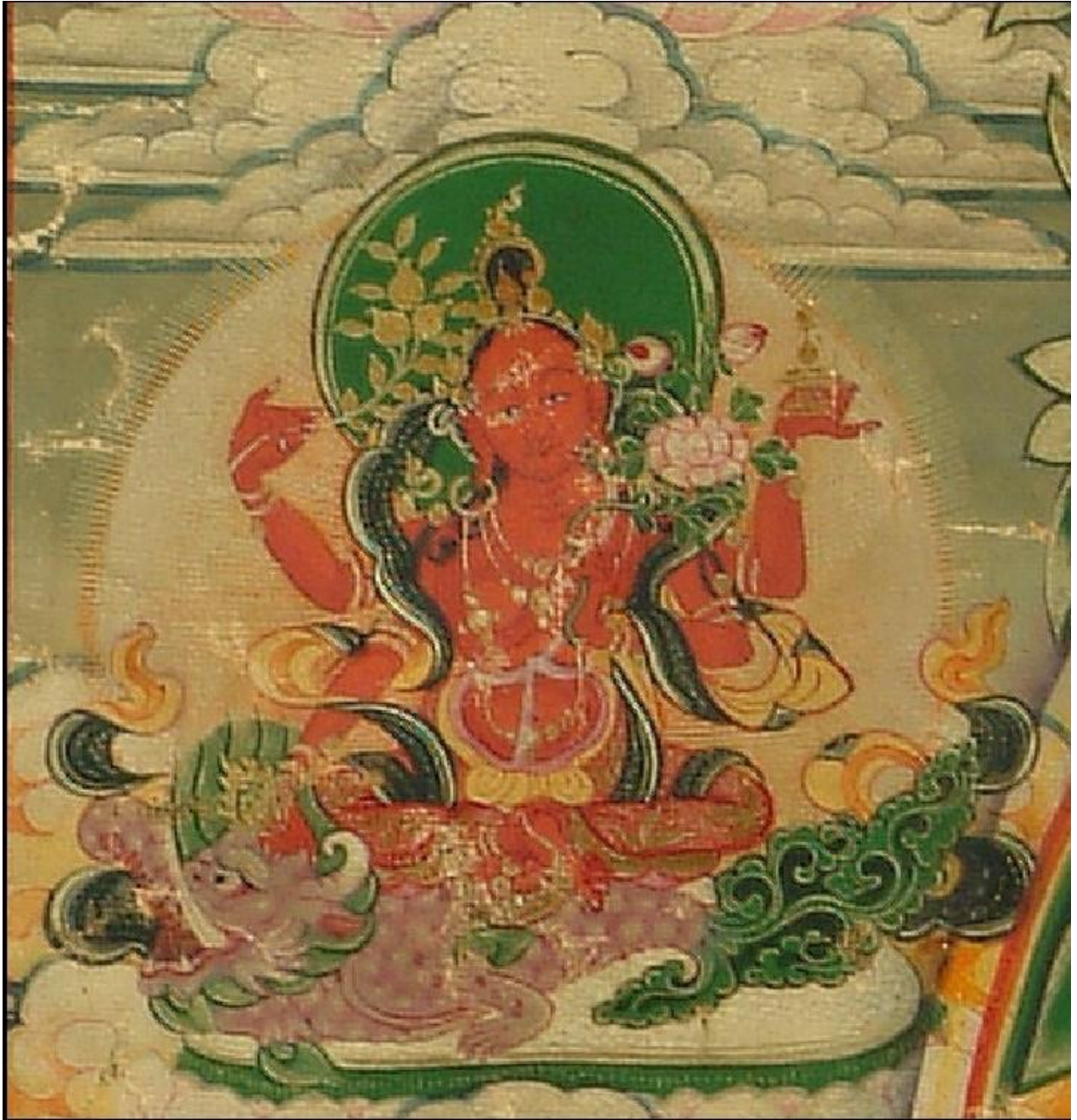
8. Tara who bestows supreme powers / Tara who crushes all maras

CH'AK-TS'ÄL TURE JIK-PA CH'EN-MO DÜ-KYI PA-WO NAM-PAR JOM-MA CH'U-KYE ZHÄL-NI Tr'O-NYER DÄN-DZÄ DrA-WO T'AM-CHÄ MA-LÜ SÖ-MA